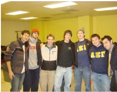
Brothers at Martha's Table in Washington, DC